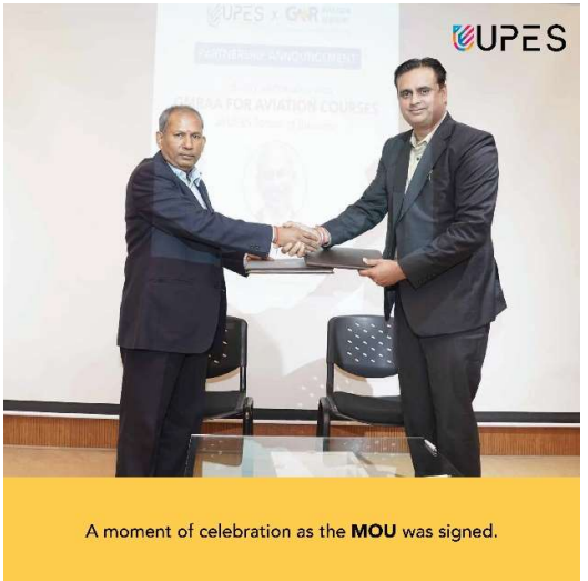
A moment of celebration as the MOU was signed.