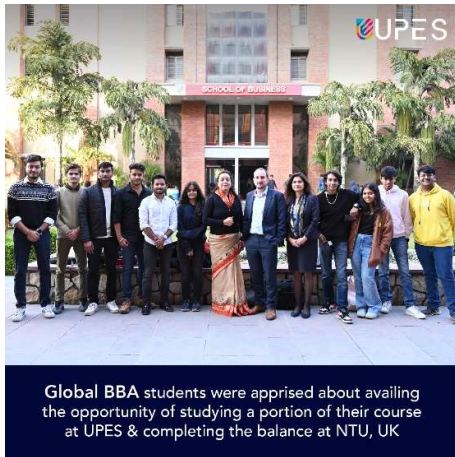
Global BBA students were apprised about availing the opportunity of studying a portion of their course at UPES & completing the balance at NTU, UK