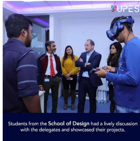
Students from the School of Design had a lively discussion with the delegates and showcased their projects.