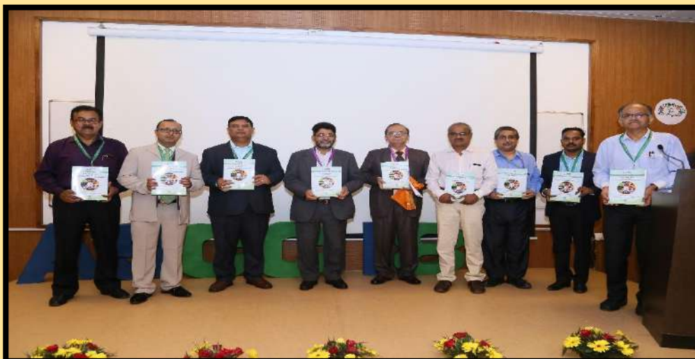
5 th Agro Supply Chain Conference, 2018

T-Corp group of cooperatives under the supervisor of the Rubber Authority of Thailand, which overlooks in both products' quality and development. It ensures their product meets international standards.